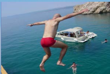
Swimming in most beautiful bays of crystal clear water

We spend the whole day in fresh air and sun. At noon we are anchoring in a bay for swimming. Siesta. After a short exercise unit in the afternoon and followed by dinner and a glass of wine in the port some might seek their bed early.