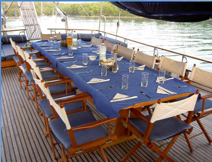
Stern - lunch table under the sunshade