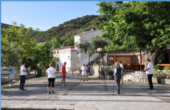
Nordic Walking Training